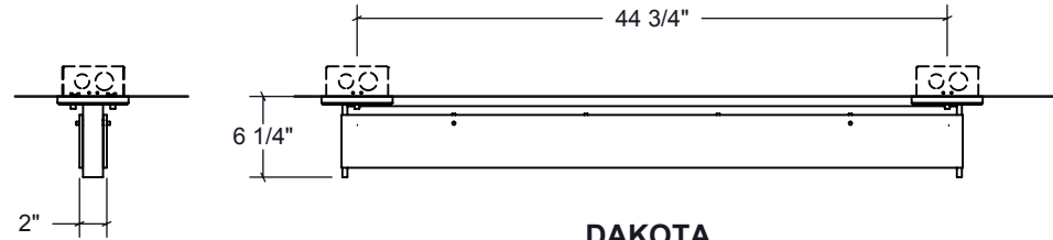
DAKOTA FLUSH MOUNT 401-FL

*NOTE: Electrician to supply and install: 4 11/16" x 2" deep SQUARE J-Box to accommodate dimming driver.